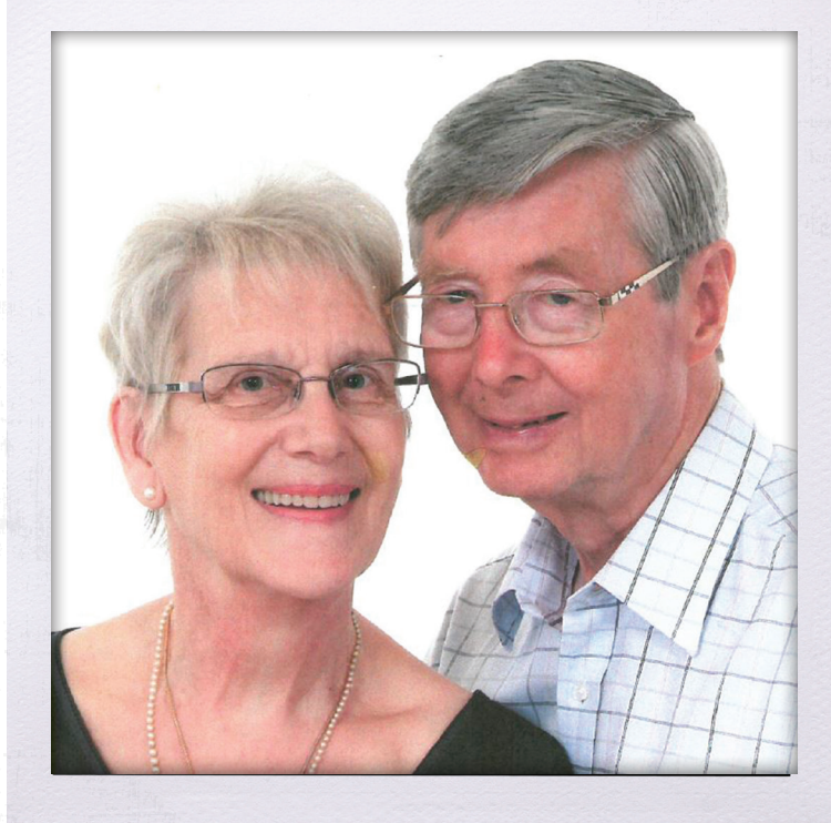
The gift of time

"St. Mary's Hospice gave us that wonderful gift."