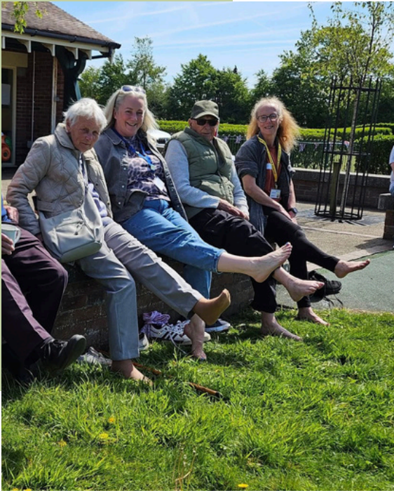
Walking bear foot in the grass, April 2025