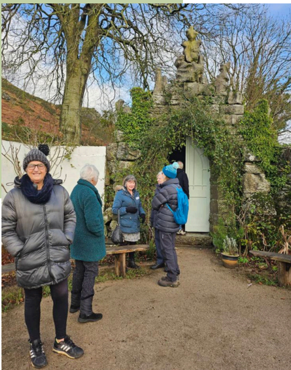
Ford Park allotments, January 2025